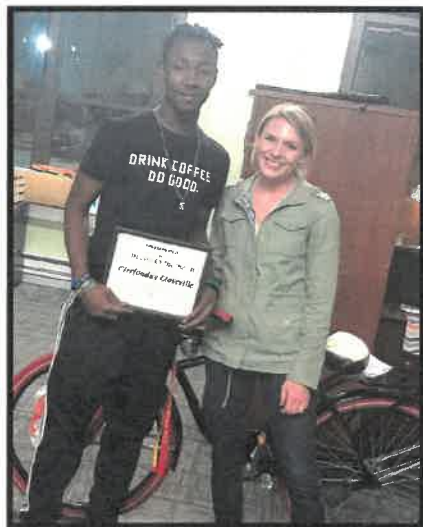
A brand new bike for our Employee of the Month!

Celebrating milestones is an integral part of our organization. Our Victory Board in the Drop In Center is filled with accomplishments!